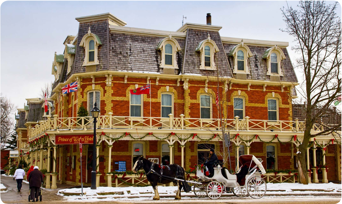
The historic Prince of Wales Hotel in Niagara On The Lake, Ontario, Canada.

An important aspect of maintaining heritage is ensuring that new development blends with the built environment of the past. Municipalities understand that an important aspect of maintaining a unique character is preserving and blending heritage. The Planning Act offers municipalities important policy tools in relation to the design of the built environment. These policies are important as they provide decision makers at the local level adequate tools to exert influence over development in their municipality, allowing them to maintain desired character consistent with the heritage and history of that municipality. This is especially important for areas which are historically sensitive. In 2015, Niagara on the Lake adopted an Official Plan which stated that new developments should respect the town's historic character and called for the usage of brick and stone as the dominant design material. Preserving historic significance is something which municipalities understand and are decisions that can truly only be made at the local level.