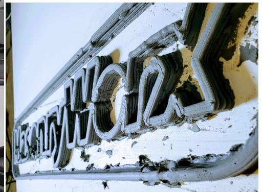
Samples of MasonryWorx logo modeled and printed by 3D-Clay printer courtesy of the University of Waterloo, School of Architecture