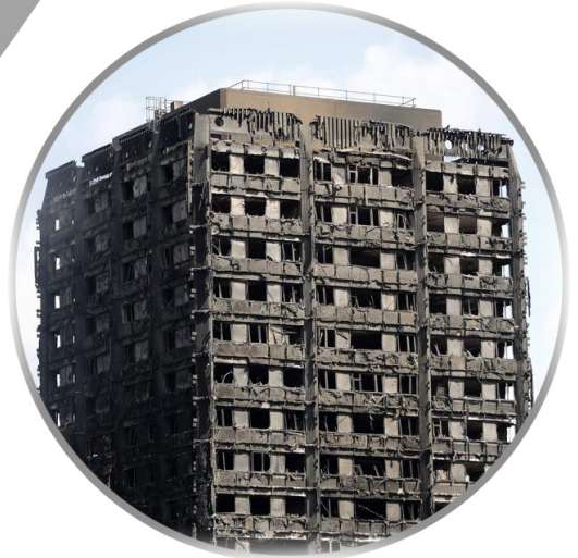
Photo: Charred remains after Grenfell Tower fire 2017

On June 14th 2017, the world was shocked by a massive fire in London which killed 71 residents of the Grenfell Tower. The pictures and videos of the tower burning were surreal. It didn't take authorities long to identify a major contributing factor which caused the fire to spread quickly. Aluminum cladding installed in a recent retrofit of the building made the fire spread along the outside of the building at a rapid rate. Since Grenfell Tower was a public housing operation the contract for renovations went to the lowest bidder, which, in the procurement process opted for a cheaper cladding material. This decision turned out to be fatal. Government officials are still dealing with the aftermath of this tragedy as Grenfell Tower was not the only building in London clad with this material. In fact, following the fire, buildings in London were subjected to a combustibility test wherein 228 failed. Much like Houston this is an example of the grim consequences associated with building cheaper and faster. The material of the cities we live in matters.