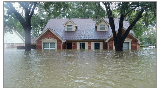
Photo: Masonry home left structurally intact after devastating Hurricane Harvey

Immediately following the storm Bloomberg published a report titled "Harvey Wasn't Just Bad Weather, It Was Bad City Planning". The report pointed out that the city had a limited growth strategy, no zoning by-laws and inadequate building codes. Unfortunately for Houston, growth came before good planning; building practices and the cheapest quickest built environment was established. The cost of Harvey may have been significantly less if planning measures were taken to mitigate storm damage.